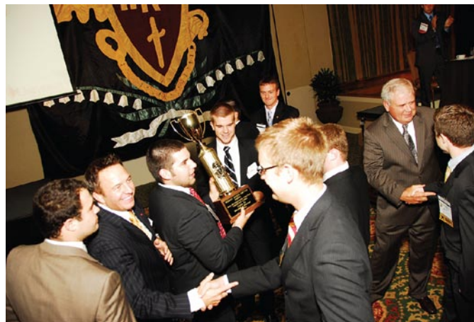
Excitement was the order of the day as the Smythe Awards were presented. Above, members of Alpha Xi Chapter (Cincinnati) receive their Champion Level Smythe Award.