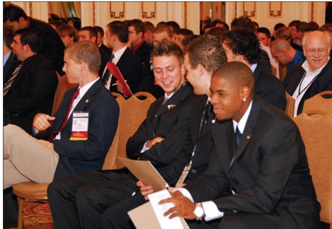
Pi Kappa Alphas from all generations gathered to celebrate the year's achievements and the special event that is convention.

The Gold Star Memorial, recently refurbished at the Memorial Headquarters, is located in the front entrance rotunda and