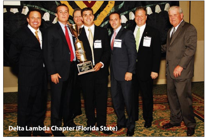
Delta Lambda Chapter (Florida State)