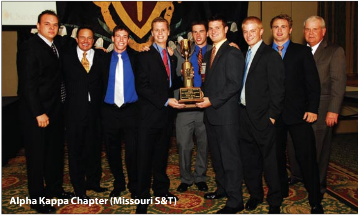
Alpha Kappa Chapter (Missouri S&T)