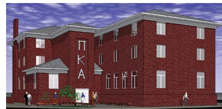
Architectural rendering of the rear of Alpha Nu's new house.

board of more than 20 dedicated alumni and more than 50 class leaders, Alpha Nu has seen strong volunteer participation.