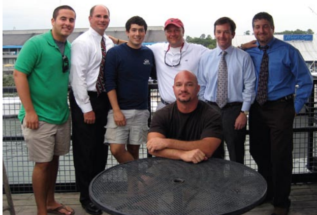
XI ALUMNI ASSOCIATION South Carolina - Xi alumni gathered in Charleston on July 14, 2008, for an evening of recounting stories at Shem Creek in Mount Pleasant.

The Alpha Zeta Alumni Association has been reorganized and reenergized, and encourages all alumni to stay in touch and participate in the association activities. Information on upcoming events may be found on the new website at www.hogpikealumni.com . Mark your calendars now to attend the Great Alpha Zeta Reunion of 2008. Actually, there will be three reunion events in Washington County the weekend of October 3 - 5, which is the Arkansas-Florida football game weekend. The pre-1966 guys and their guests will gather on Friday, October 3, for golf and a reception dinner at Springdale Country Club. The 1966-69 alumni will meet at the Hog Haus on Dickson Street on October 3, while the post 1970 group will be gathering at the Inn at Carnal Hall, also on October 3. Three great reunions on the same day! If you plan to attend and do not already have room reservations and/or football